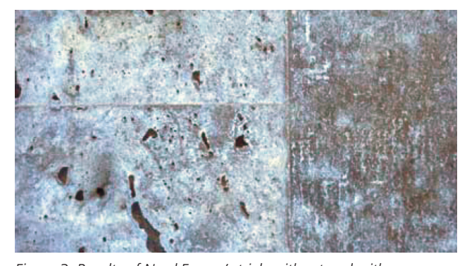
Figure 3. Results of Nord France's trials without and with the Formtex®.

Formtex® was glued to the formwork elements (see Application Guide: gluing method) due to the shape of the elements (curves etc.) and as the weater conditions allowed gluing (dry weather). The contractor, Nord France, carried out trials prior to casting the bridge piers to determine the effect of the Formtex® liner.