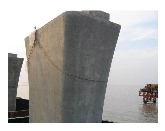
Finished piers, on their way to installation, with a smooth and dense concrete surface due to the usage of CPF Formtex®.