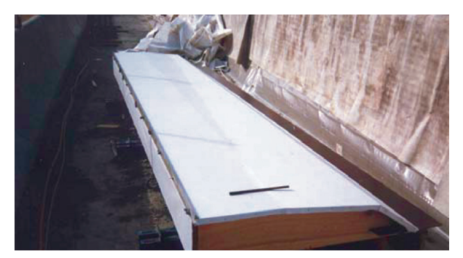
Figure 2. A formwork element lined with Formtex® ready for casting.

Formtex® was used for the project. The liner was used twice.