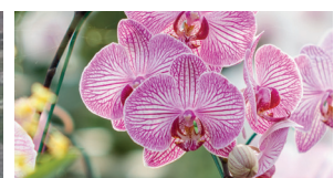
Certain plants require extra careful growing conditions.