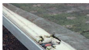
Good filter properties