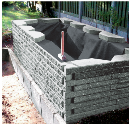
Use the fabric in raised beds

Fibertex® Home and Garden products are easy to cut, sew and staple.