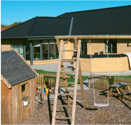
Ensure a good foundation for the playground