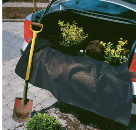
Protect against dirt