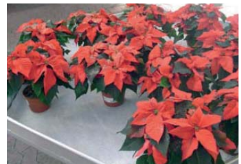
Match any bench size up to 540 cm