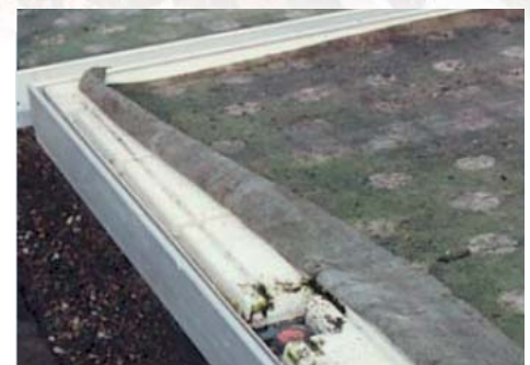
Good filter properties