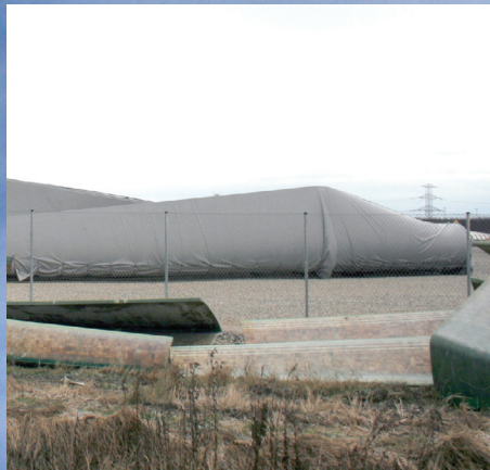
UV-protection - high resistance to puncture

Reduce production costs, save materials, save time.