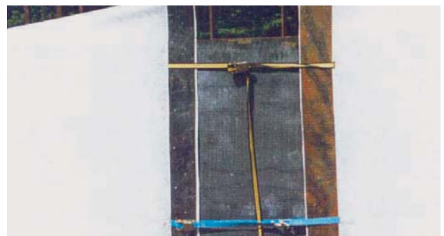
Figure 3. The liner is tensioned with clamps.

A new tensioning method was used: Formtex® was rolled around the formwork and tensioned vertically.