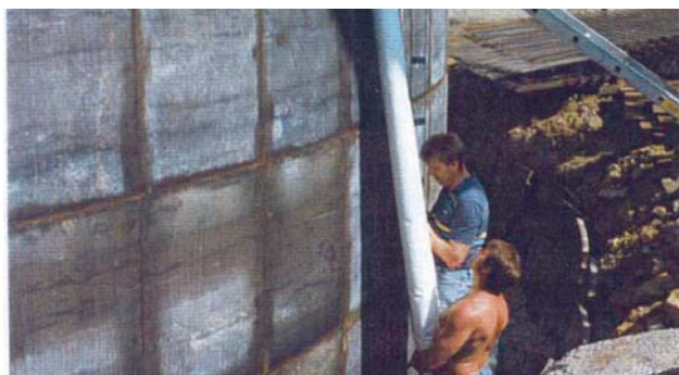
Figure 2. The roll is prepared for tensioning.

Formtex® was used for this project. The liner was only used once as a new tensioning method was tested.