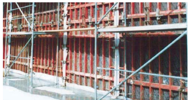
Figure 3. The concrete is vibrated and the water escapes under the formwork.

For fixing the Formtex® the tensioning method was used as the elements were of a fit dimension.