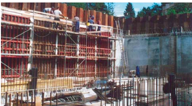
Figure 2. Casting of the west wall.

Formtex® was used for this project - the liner was used twice.