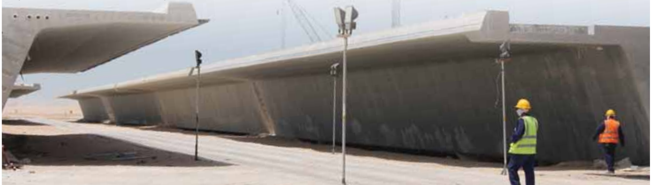
The giant bridge spans in the storage facility in the desert where they are left to set prior to offshore transport and installation.