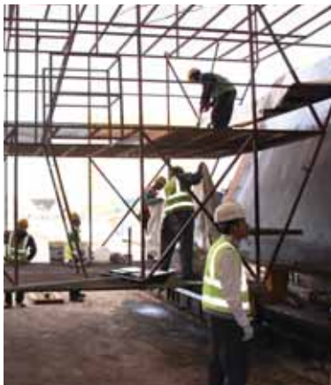
Formtex® is attached to the moulds with a special glue.