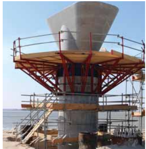
The tested and approved prototype of a bridge pillar.