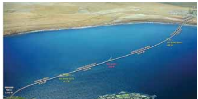
The 36 km long causeway will connect Kuwait City (bottom of the photo) and Shubiyah New Town.

Fibertex Nonwovens has worked for more than a decade to be qualified for the project. In this connection, Formtex ® was tested in laboratories and benchmarked against competing products. Moreover, Fibertex Nonwovens has carried out extensive consultancy, teaching and training activities in Kuwait before the production of the concrete started. The preparatory activities took place in large warehouses in the middle of the desert, where the 60 m long, 25 m wide and 7 m tall bridge elements were constructed.