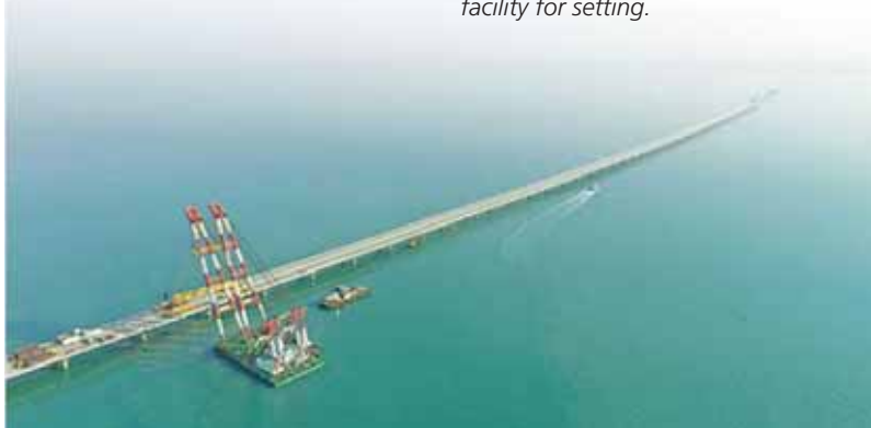
Floating cranes are lifting bridge pillars and bridge spans in place in the bay.