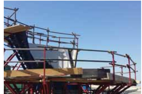
Steel shutterings are lined with Formtex® – it is important that the cloth follows the curves of the mould.