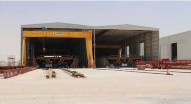
Special casting hangars were built for the construction of the 60 x 25 x 7 m spans.