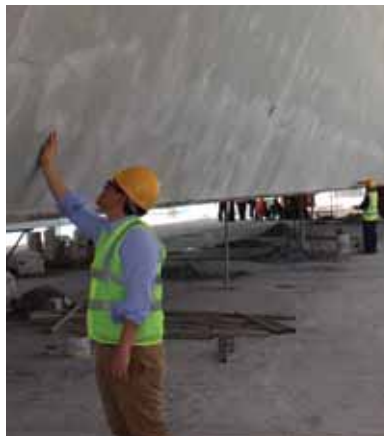
The bridge spans are quality-assured before being lifted to the storage facility for setting.