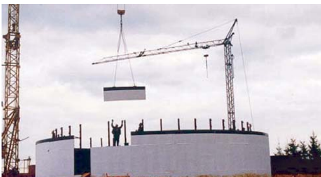
Figure 2. An element lined with Formtex® is hoist into place by a tower crane.

Formtex® was used for the project - the liner was used only once.