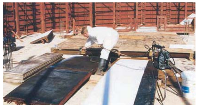
Figure 3. Glue is sprayed onto a formwork element and a length of Formtex® is unrolled.

The Formtex® was glued onto the formwork elements (see Application Guide: gluing method).