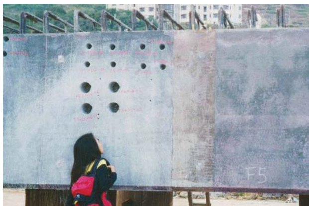
Figure 2. The trial beam, with the competing product (left), without formliner (middle) and Formtex® (right).

The contractor, Hyundai, carried out a trial in November 2001 to determine the effect of different CPF liners. Formtex® was glued to the same metal formwork as the competing products, and the liners were tested in the same casting, so they had exactly the same performance conditions.