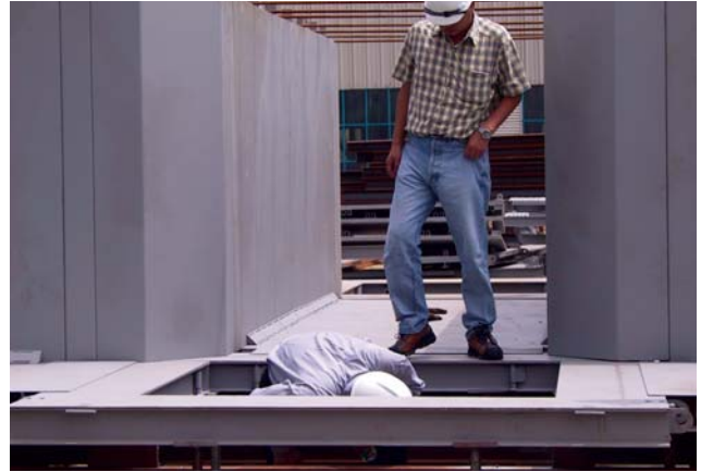
Figure 5. The formwork for the huge beams is inspected.