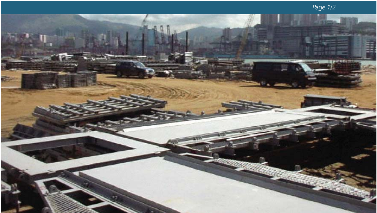
Figure 1. The construction site at Container Terminal No. 9.

The client required a dense concrete in all reinforced concrete quays and edge structures, constantly exposed to salt water or salt-water spray. Formtex® CPF-liner was chosen to secure a dense concrete with extended durability in this aggressive environment.