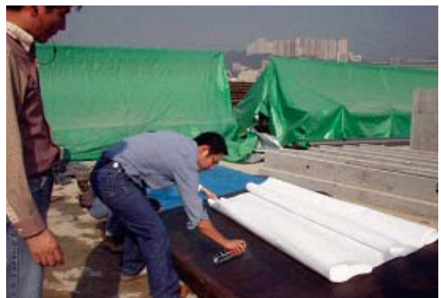
Figure 9. Test formwork is prepared with the competing product on the left and Formtex ® on the right.