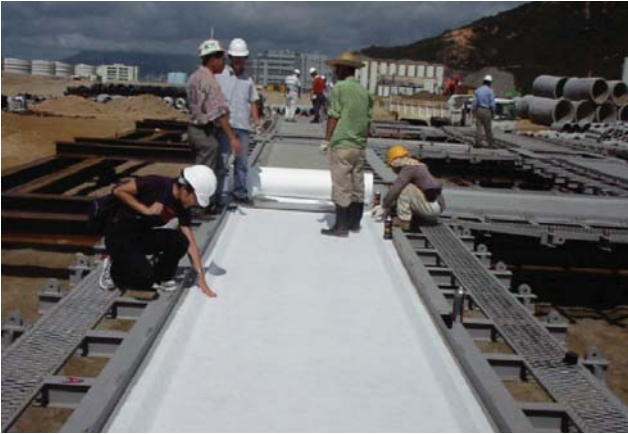
Figure 4. Formtex ® is glued to the formwork (bottom).