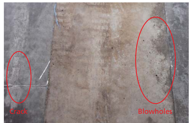
Figure 3. Achieved concrete for competing product (left), without formliner (middle) and Formtex® (right).

The concrete cast with the competing CPF-liners appeared smooth but with some cracks. The concrete cast without using formliner appeared rough and with many blowholes. Concrete with Formtex® appeared smooth and dense. On the basis of these results and consecutive testing at an independent test laboratory, Formtex® was selected for the Container Terminal No. 9 project.