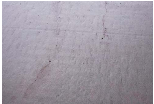
Figure 7. Several cracks in the surface of the test of the competing product.