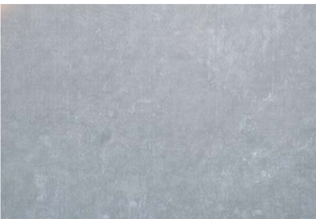
Figure 8. Surface achieved with Formtex ® .