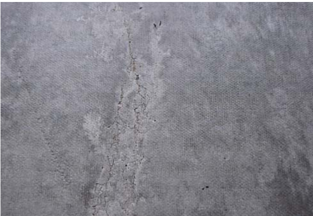
Figure 6. A large crack in the surface of the test of the competing product.