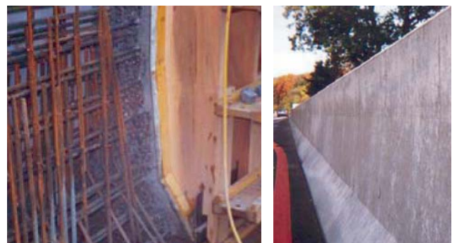
Figure 3. Casting of parapet and finished result.

The fixing of the Formtex® to the formwork elements was carried out slightly different than normally as the formwork elements were rather small. The liner was stapled to the bottom of the formwork, tensioned manually and then stapled to the top of the formwork.