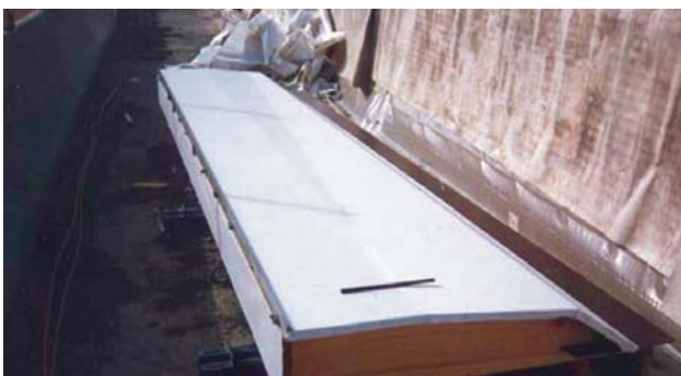
Figure 2. A formwork element lined with Formtex® ready for casting.

Formtex® was used for the project. The liner was used twice.