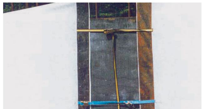
Figure 3. The liner is tensioned with clamps.

A new tensioning method was used: Formtex® was rolled around the formwork and tensioned vertically.